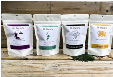
Tea from St. Steve's Farm-Crafted Beverages in Hudsonville. St. Steve's is one business that has utilized trainings and support from the MSU Extension Product Center

In 2022, 79 Ottawa County residents utilized courses and consultations from the MSU Extension Product Center. The MSU Product Center supports innovation and growth for business, industry and entrepreneurs in food, agriculture and natural resource sectors. Residents utilized the following programs offered: